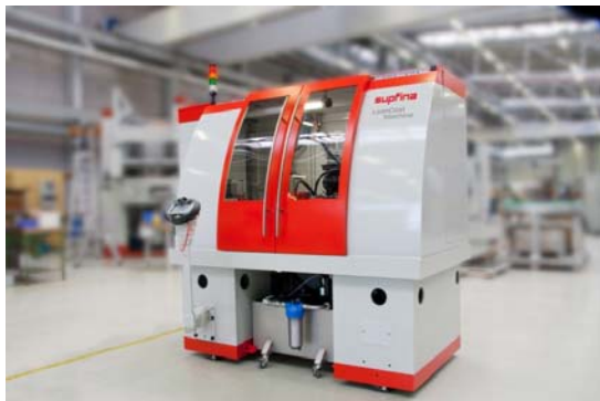
Fig. 1 Supfina Lean Cost Machine® Overview

Supfina's Lean Cost Machines® can be equipped with ready-assembled modules designed to match specific machining tasks. Whether fixed in place, manually adjustable or NC controlled, as many as six Supfina attachments for stone and tape finishing can be used at the same time as brushing and polishing attachments. Thanks to the unique design of this installation, all the modules can be integrated in the machine with no further effort.