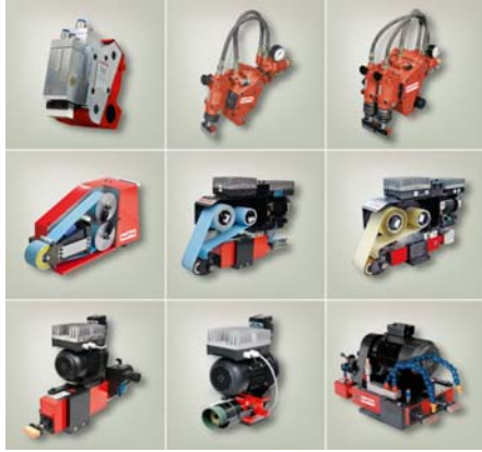
Fig. 3 Supfina superfinishing attachments Overview

With over 10,000 attachments sold worldwide, Supfina is also a market leader in this segment. The range of superfinishing attachments available includes over 12 models