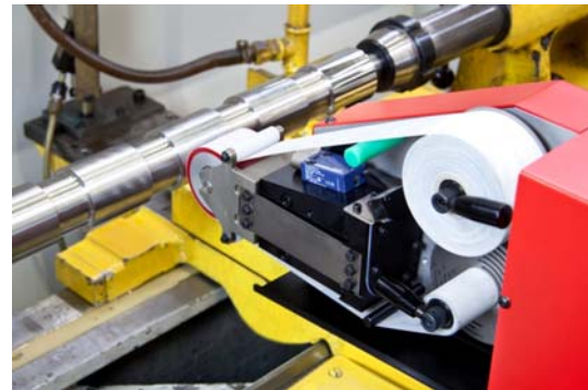
Fig. 4 + 5 Supfina 210 superfinishing attachment on a lathe

Consumables such as tapes, stones, polishing pastes and many other items are available from Supfina's Lean Systems® section to match each machine. High-grade superfinishing tools at a consistently high level of quality ensure high-standard repeatable results.